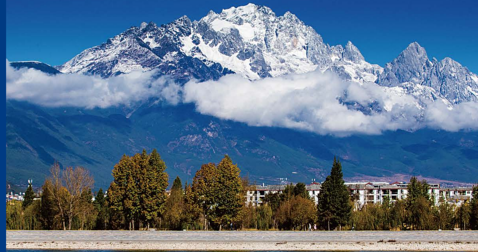
Jade Dragon Snow Mountain